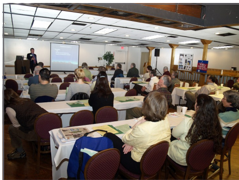
Family Physicians are required to maintain Continuing Medical Education through sessions like the one above

Established in 1951, the MAFP is the largest specialty physician organization in Maine, currently representing over 700 family physicians, family medicine residents & medical students. Family physicians, like other medical specialists, complete an extensive 3-year residency program after graduating from medical school.