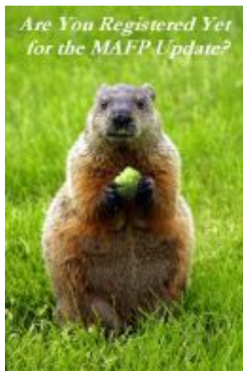
Are You Registered Yet for the MAFP Update?

Download brochure & registration form at: www.maineafp.org