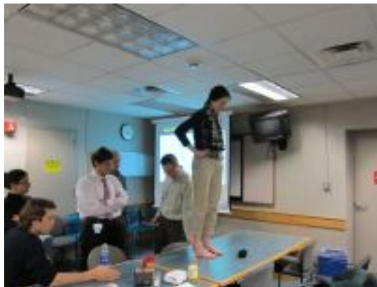
A fun way to experience Family Medicine! (recent MMC FMIG meeting)